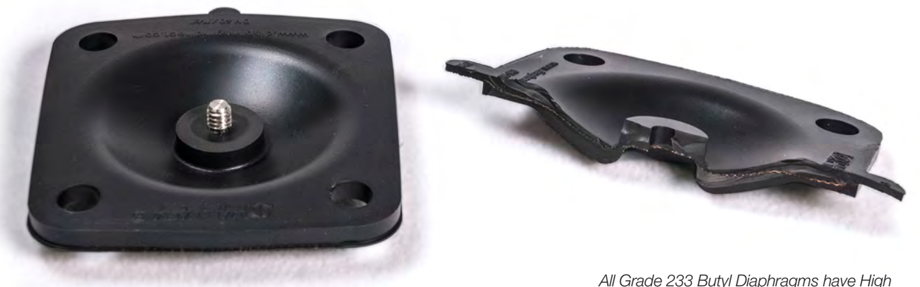
All Grade 233 Butyl Diaphragms have High Performance Woven Fabric Reinforcement